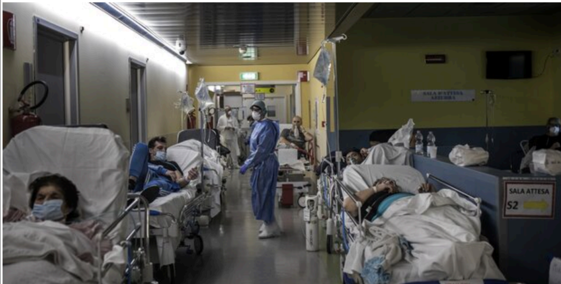
Auch das Krankenhaus Papst Johannes XXIII. in Bergamo ist über seine Kapazitätsgrenzen belastet

In der Klinik San Pietro spielen sich täglich neue Dramen ab. Menschen ringen um Luft, ihre Angehörigen dürfen nicht zu ihnen, nicht einmal am Ende.